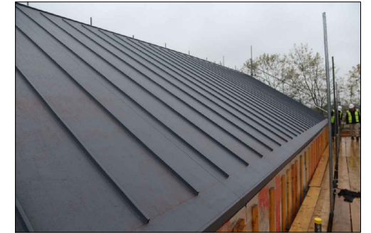
Mansard Roof - Grey Single Ply Membrane with Standing Seam Detail