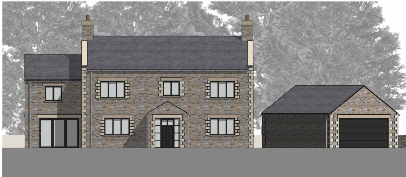
NORTH ELEVATION 1:50