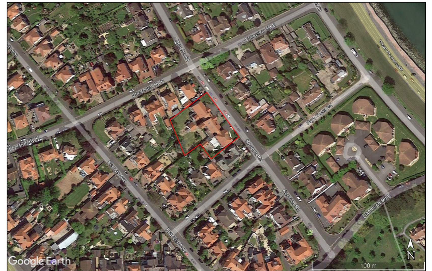
AERIAL IMAGE - NTS

NOTES ALL WORK TO BE CARRIED OUT IN ACCORDANCE WITH THE BUILDING REGULATIONS AND THE REQUIREMENTS OF THE LOCAL AUTHORITY.