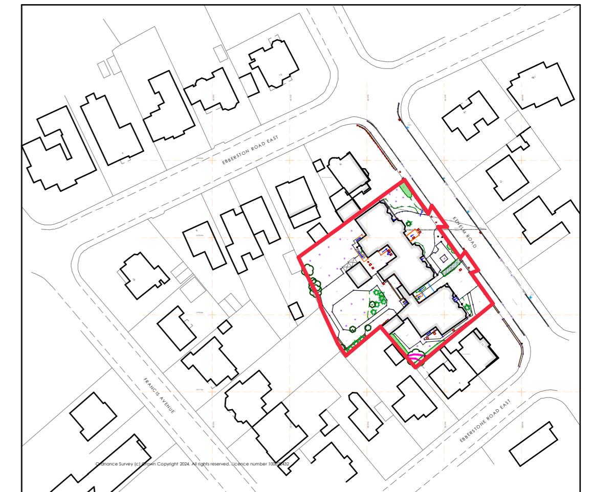
CONTEXT SITE PLAN - SCALE 1:1250